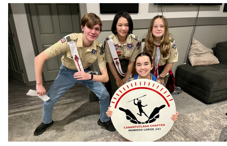
2024 Chapter Leadership