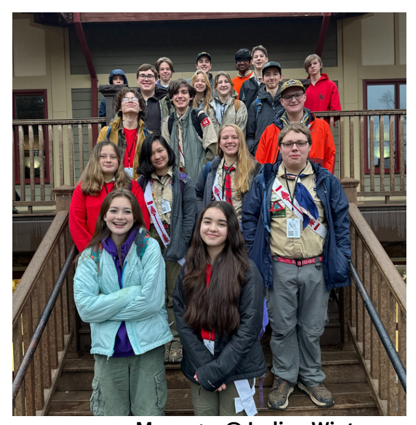
Mowogo @ Indian Winter

Camp Bert Adams welcomed Scouts from E6 to join in fun and fellowship. There was great representation for the Canantutlaga Chapter as well as Mowogo Lodge. Brothers participated in workshops, trainings, fun fellowship games, and an amazing campfire. Over 400 Arrowmen attended from our section and had a great time meeting new people and learning new ways to create a positive impact in Scouting and our communities.