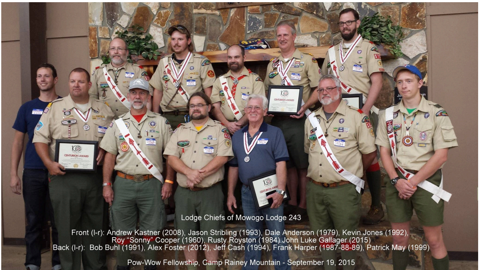
Lodge Chiefs of Mowogo Lodge 243