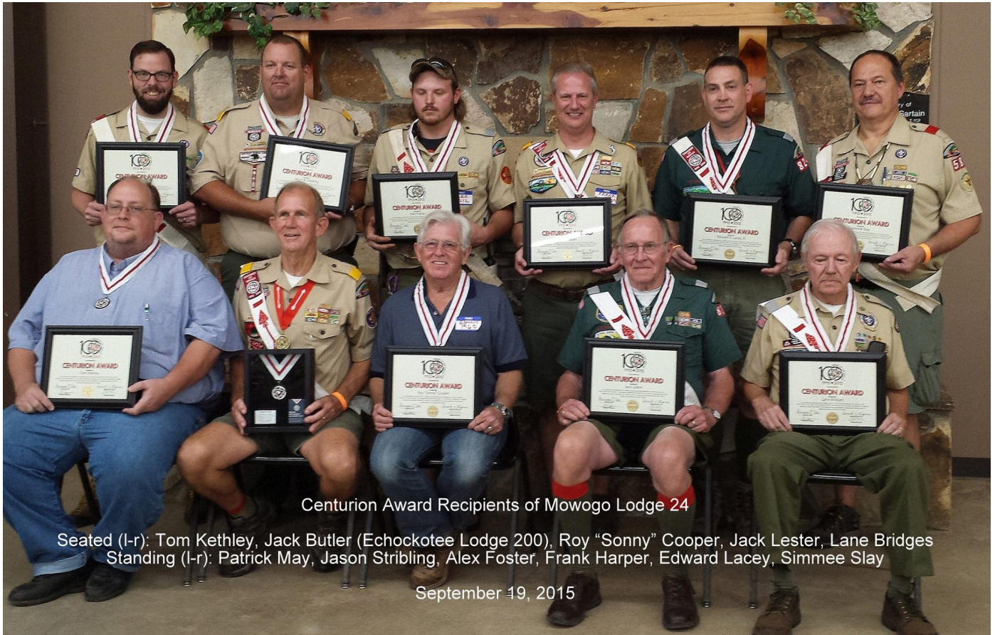
Centurion Award Recipients of Mowogo Lodge 24