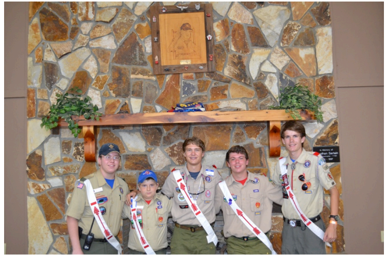
2016 Lodge Officers. Can you name them?