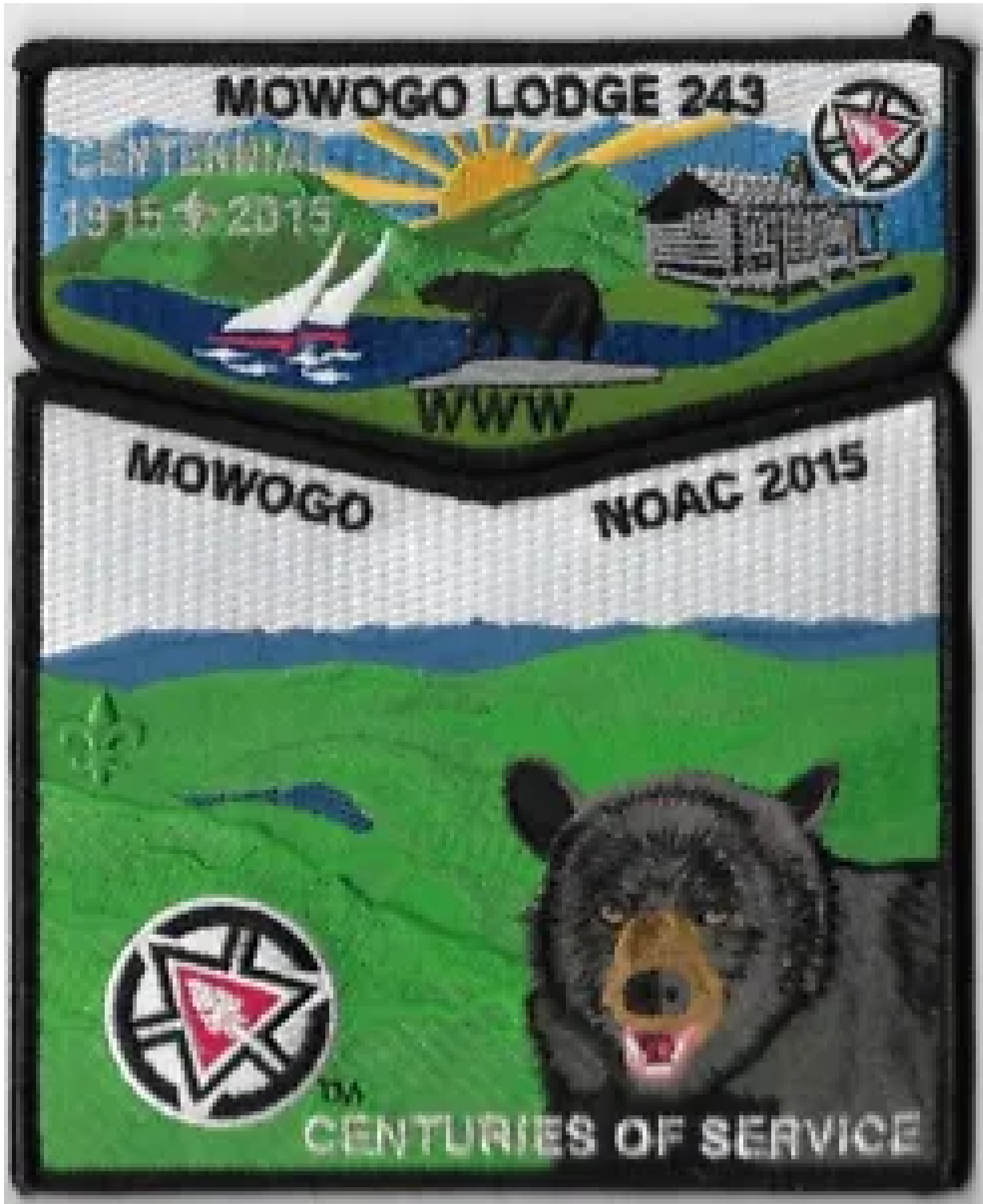
2015 (Centennial) NOAC Patch