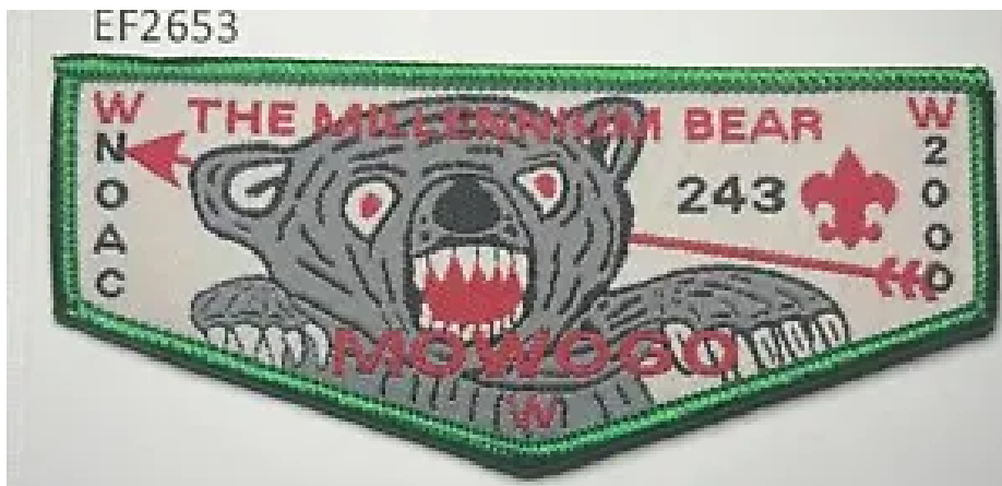
2000 Mowogo NOAC Patch