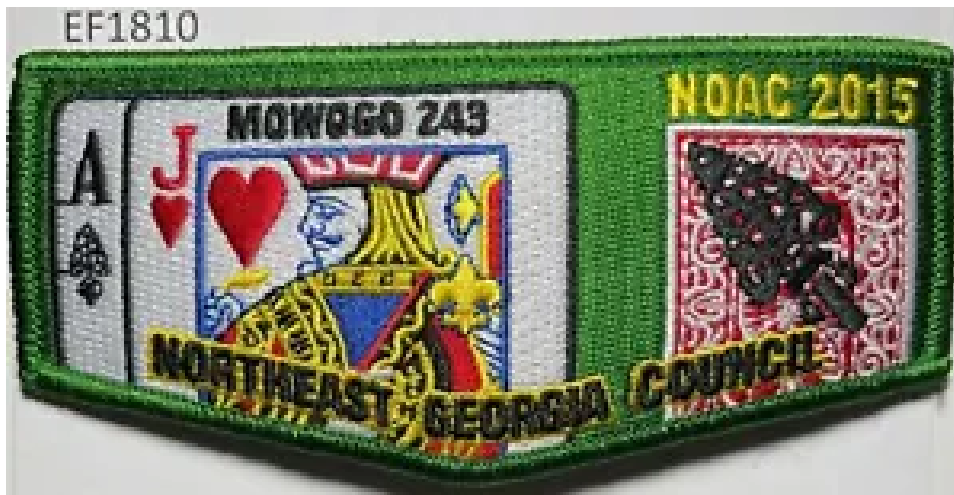
2015 NOAC Patch