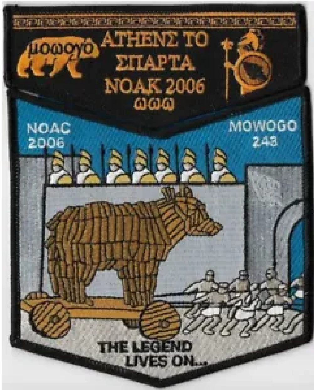
2006 NOAC Patch