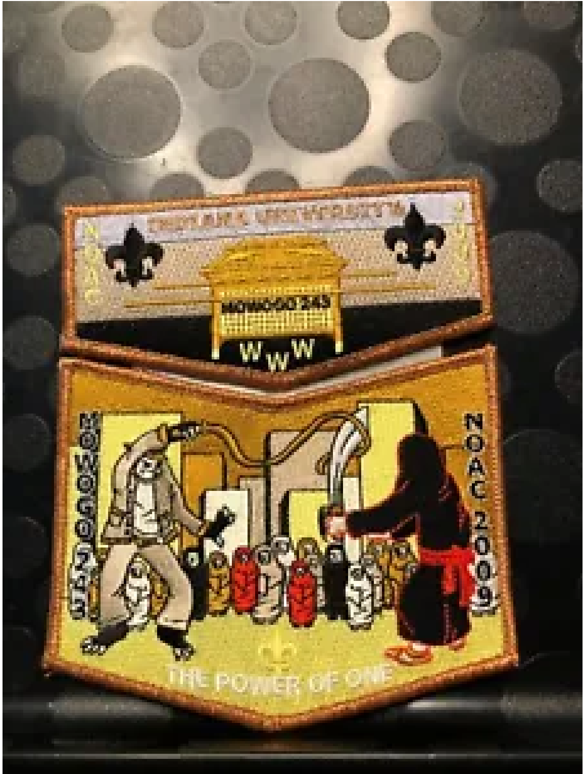
2009 NOAC Patch