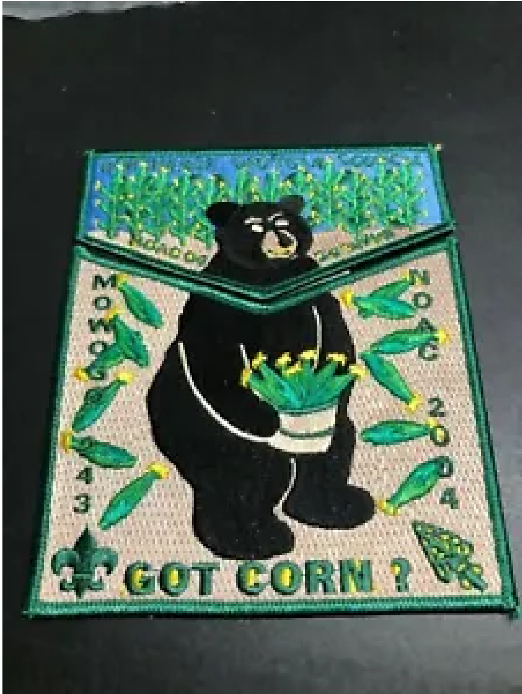
2004 NOAC Patch