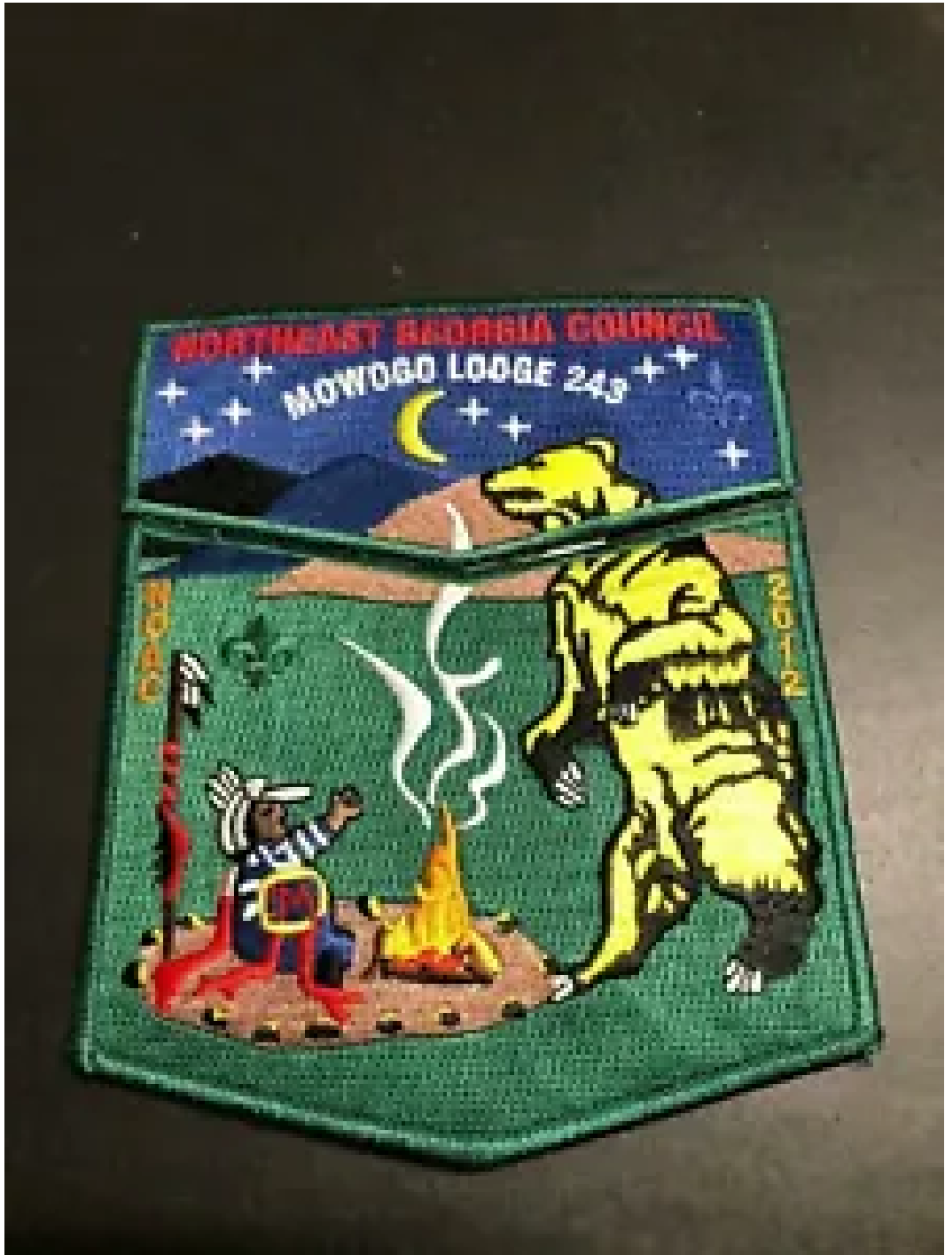
2012 NOAC Patch